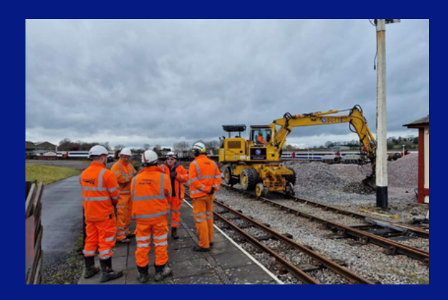
THIS MONTH WE ARE SHARING UPDATES FROM DOTTS AND WHAT THIS NOW MEANS FOR YOU.